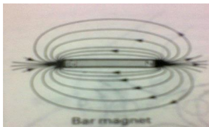
Line of force due to bar magnet